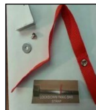
Lockdown panic bar strap