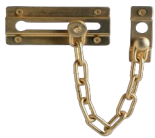
Locking door chain

These types of locks and latches are prohibited and do not meet current fire code.