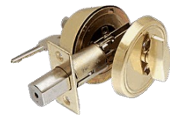
Dead bolt/thumb turn